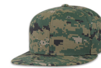
MCU / MCU / MCU