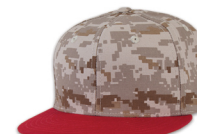
RED / DES / DES