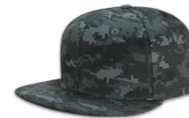
NTG / NTG / NTG