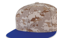
ROYAL / DES / DES