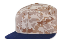
NVY / DES / DES