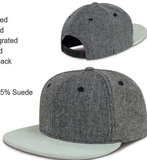
Salt & Pepper/Stone

This Suede Bill Snapback is a structured 6 panel cap with a poly/wool crown and a suede bill. This cap features an integrated cotton sweatband, stitched eyelets and is finished with a vintage plastic snapback closure.