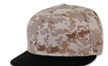
BLK / DES / DES