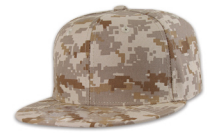
DES / DES / DES